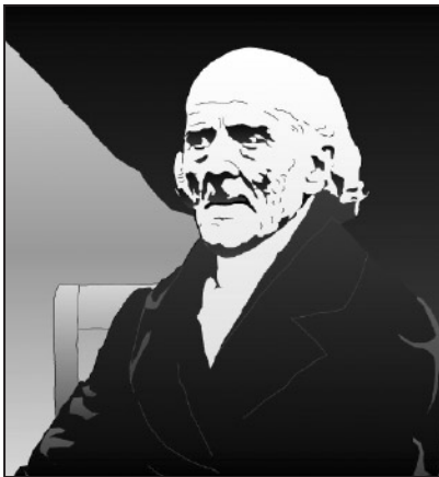
Fig. 1: Samuel Hahnemann old age

I t amazes many people to watch a trained therapist be able to detect emotional conflicts within minutes with the aid of specific homeopaths. The method used is known as Psychosomatic Energetics – which I developed more than a decade ago after having long suspected, in my work as a naturopathic physician, that many diseases harbored concealed emotional conflicts. Certain mixtures of homeopathic remedies enable one to reliably sniff out these emotional conflicts. I'd like to describe here in greater detail how this works and what conclusions can be drawn therefrom – particularly with regard to a general theory of homeopathy.